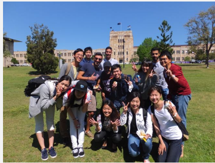
Beautiful my classmates