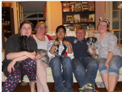
Lovely my host family