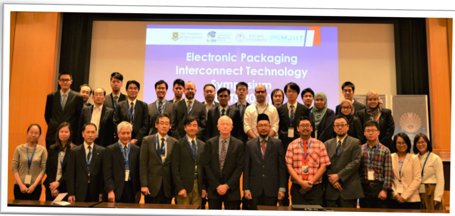
The EPITS2017 attendees at Kyushu University Nishijin Plaza.

Universiti Malaysia Perlis (UniMAP), Malaysia and the Malaysia Japan International Institute of Technology (MJIT) Universiti Technology Malaysia, Malaysia. The symposium was at the Kyushu University Nishijin Plaza facility, Fukuoka.