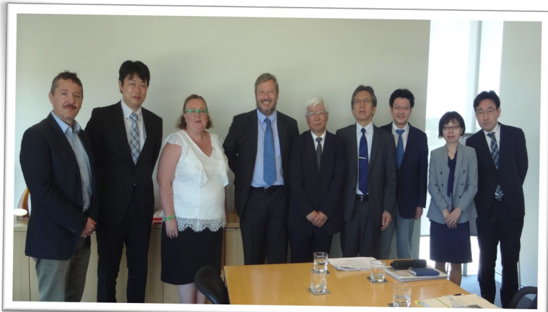
The Kyushu University Faculty of Economics Delegation with ICTE staff at the agreement signing