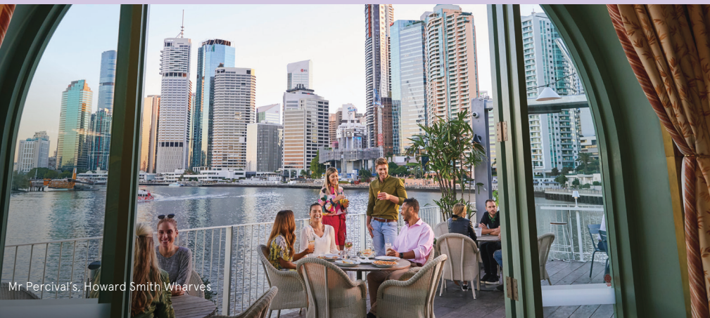
Mr Percival's, Howard Smith Wharves