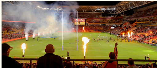
Suncorp Stadium, Milton

Whether you're fixed on a foodie event, sporting showdown, exclusive art exhibition or live performance, Brisbane is buzzing with events. From heart-stopping to heart-warming, in-stadium to on-stage, scan the QR code below and mark your calendar with Brisbane's epic line-up of events.