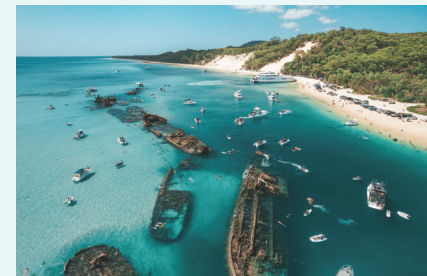
Tangalooma Wrecks, Moreton Island/Mulgumpin