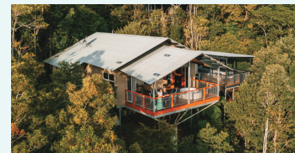
O'Reilly's Rainforest Retreat, Lamington National Park