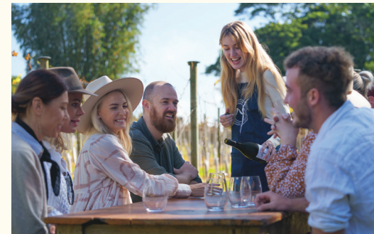
Witches Falls Winery, Tamborine Mountain