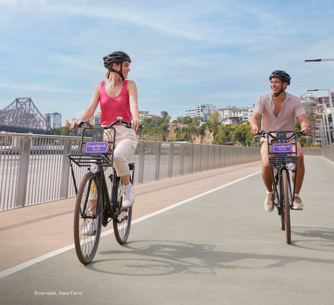
Riverwalk, New Farm

Get around Brisbane easily, whether it's walking, cycling or on public transport - from buses to trains and even ferries on the river. Scan below for more details and to plan your journey with Translink.