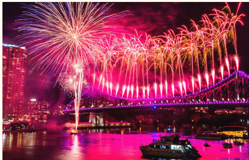
Brisbane Festival, Citywide