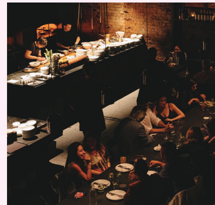
Agnes, Fortitude Valley