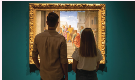
Gallery of Modern Art

From ticking off the major city attractions to culinary exploration or delving into Brisbane's rich First Nations culture, you'll never run out of things to do.