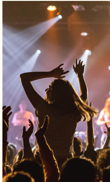
The Tivoli, Fortitude Valley