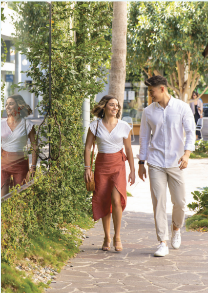
James Street, Fortitude Valley