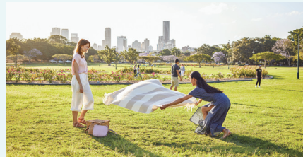
New Farm Park, New Farm