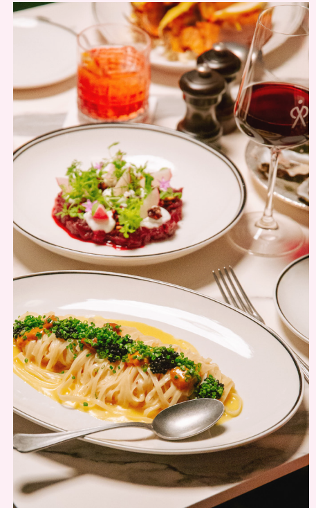
Rothwell's, The City