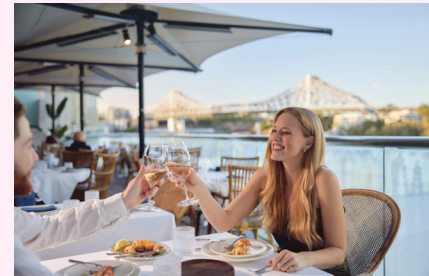
Tillerman, The City

Discover Brisbane's acclaimed dining scene along the river, visit stunning rooftop restaurants and bars with unparalleled views of the city skyline and uncover hidden gems in laneways – from urban wineries to speakeasy-style cocktail bars.