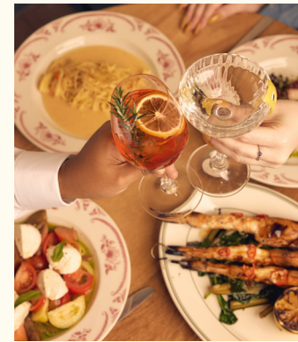
Settimo, The City