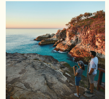
North Stradbroke Island/Minjerribah