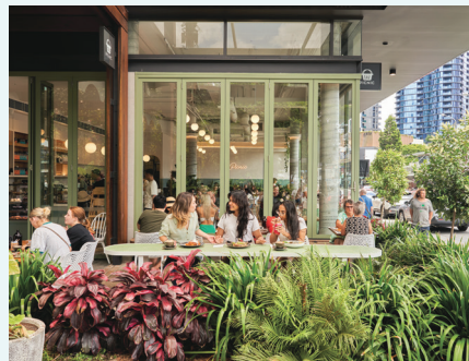
West Village, West End